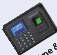
Time & Attendance