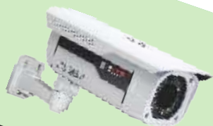
HD CCTV Camera