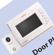
Video Door Phone