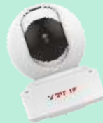
Home Security Camera