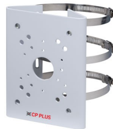
CP-UA-B3P Pole Mount