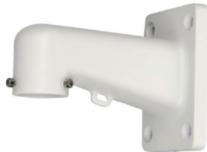
CP-UA-B05W Wall Mount