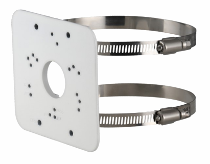
CP-UA-B2P Pole Mount